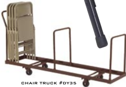
CHAIR TRUCK #DY35

NON-MARRING REPLACEABLE GLIDES THAT MATCH FRAME COLOR